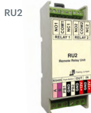
2 Relay Remote Unit