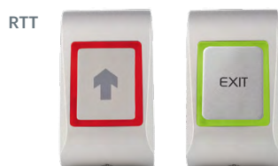
1 Relay Remote Unit and Push Button