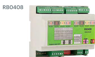
Input/Output Relay Board